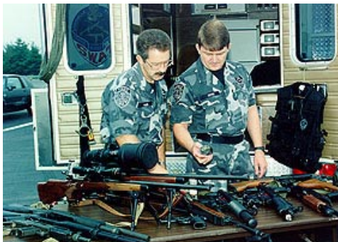
Your Office !!

If so, call or e-mail your service request now !!